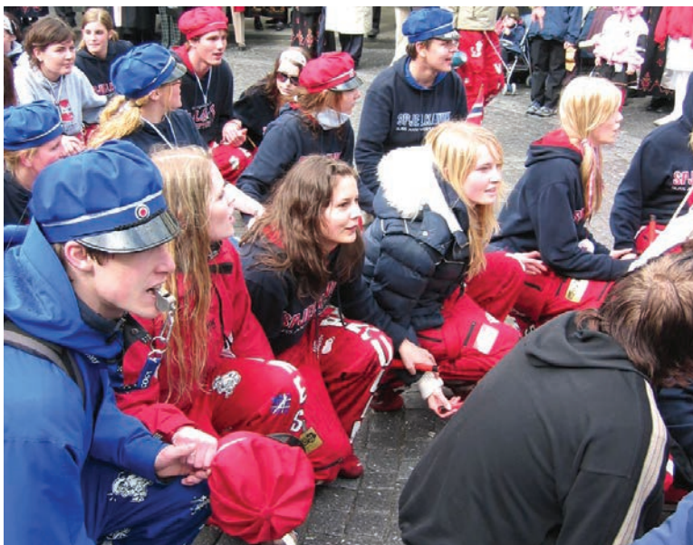
Norwegian high school students ready for their month-long party.