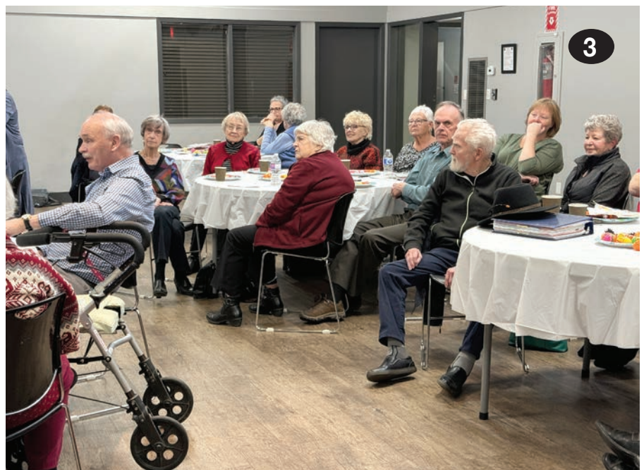
3. Members enjoying Norway slideshow.

For more photos of Solglyt Lodge members and events, please visit: https://www.flickr.com/photos/sonsofnorway/albums/