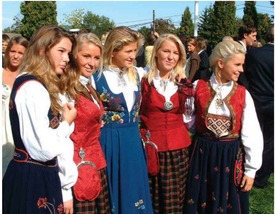
Teenage girls proudly wear their traditional Norwegian bunads.

modern take on a folk costume. Find examples of patterns here: https://faebrik.no/products/faestdrakt